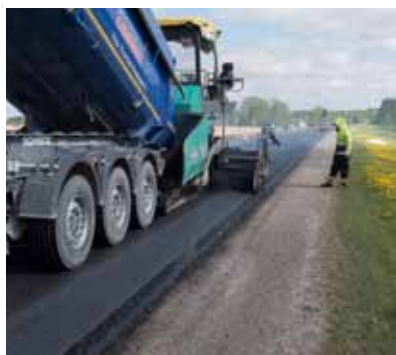
New asphalt layer