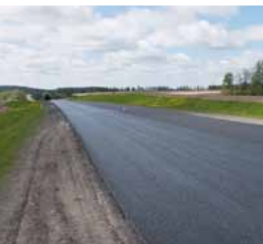
Bituminous emulsion spread